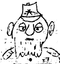
* * *