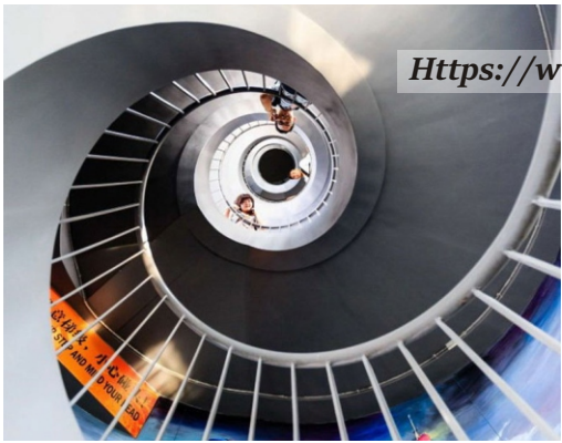
Canton Tower Spider Walk

https://www.chinadiscovery.com/guangdong/guangzhou/canton-tower.html