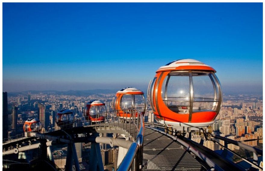
Canton Tower Bubble Tram

"If you thought the London Eye was a stomach-churning experience, then look away now".