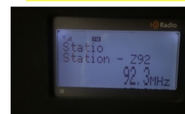
OMAHA, NE 796 miles