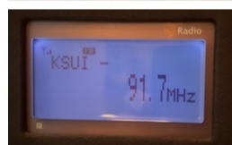
Iowa City, IA 593 miles