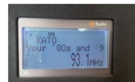
New Ulm, MN 806 miles