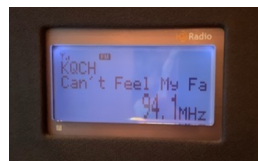
OMAHA, NE 796 miles