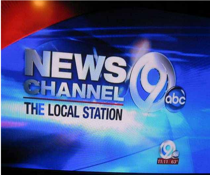
WSYR-17 Syracuse, NY 170 mi Tr seen 10-11-11