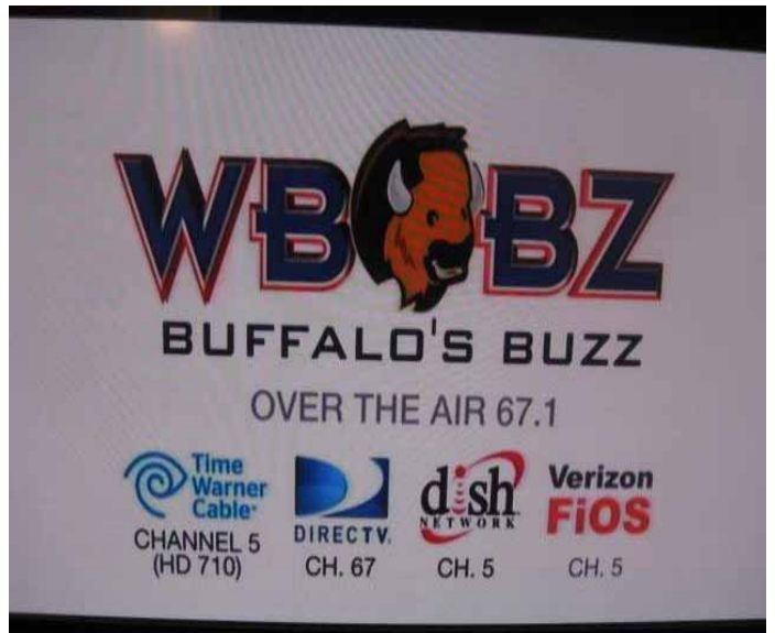
WBBZ-7 Springville, NY 95 mi Tr seen 4-3-12