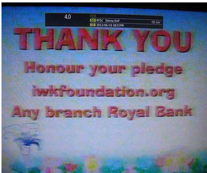
CHCB-4 Sydney, NS 944 mi Es seen 6-10-12