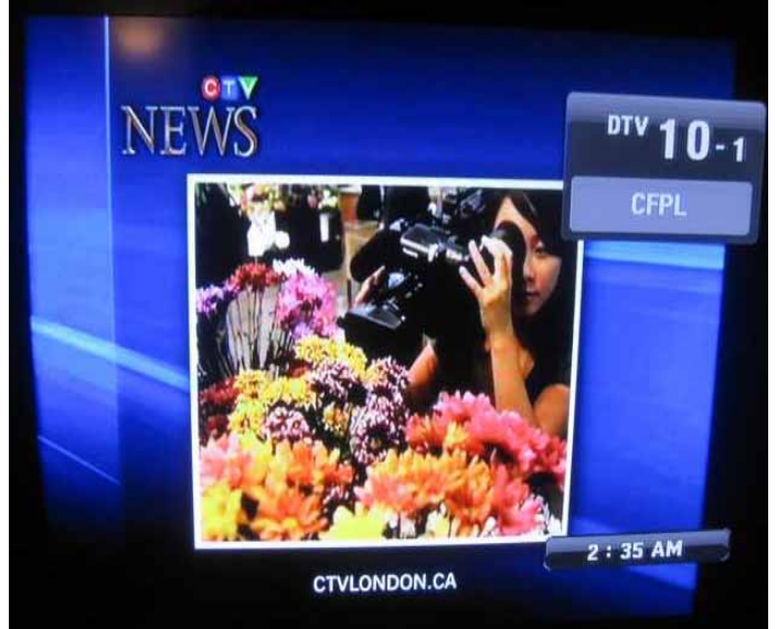
CFPL-10 London, ON 120 mi Tr seen 11-8-11