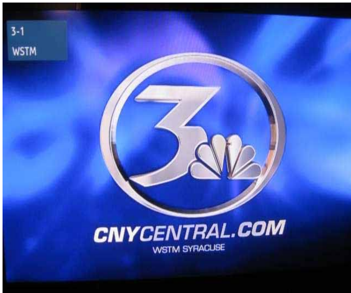
WSTM-24 Syracuse, NY 170 mi Tr seen 4-7-12