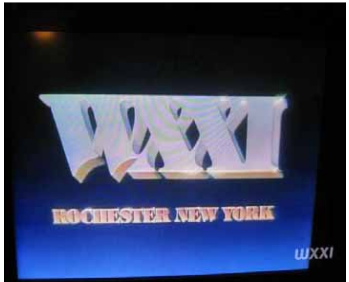
WXXI-16 Rochester, NY 98 mi Tr seen 2-16-12