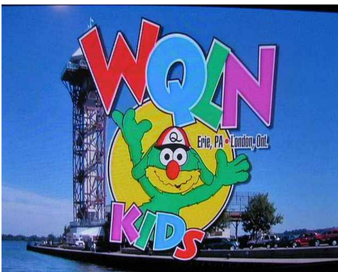
WQLN-50 Erie, PA 127 mi Tr seen 3-23-12 note the dual nation ID!