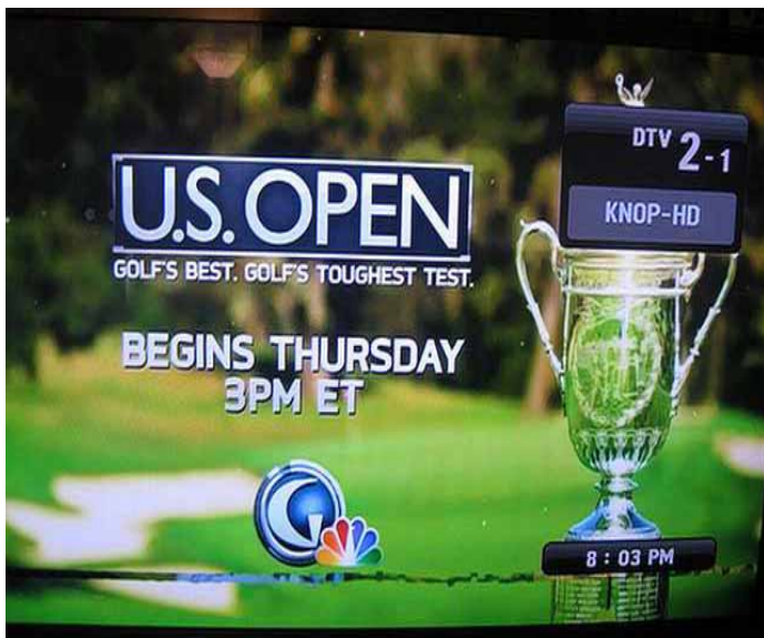
KNOP-2 North Platte, NE 1109 mi Es seen 6-10-12 "first DTV Es!"