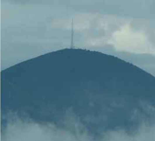
WLOS-TV tower atop Mt. Pisgah, NC