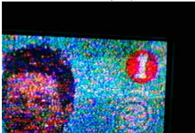
CANAL UNO CH5 COLOMBIA