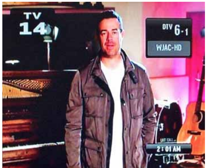
WJAC-34.1 Johnstown, PA 277 mi Tr seen 8-10-13