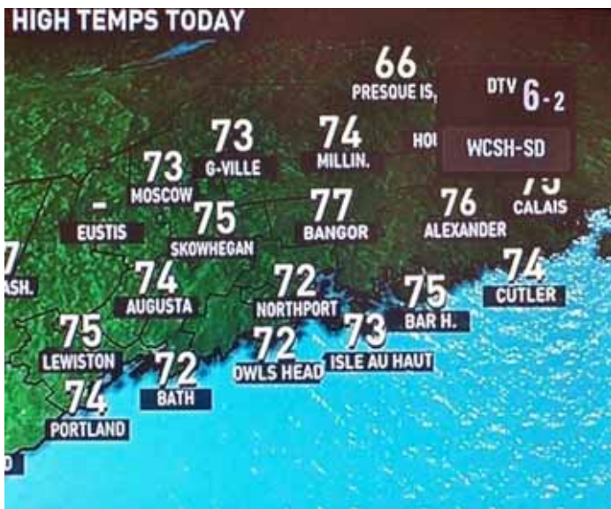
WCSH-44.2 Portland, ME 229 mi Tr seen 9-21-13