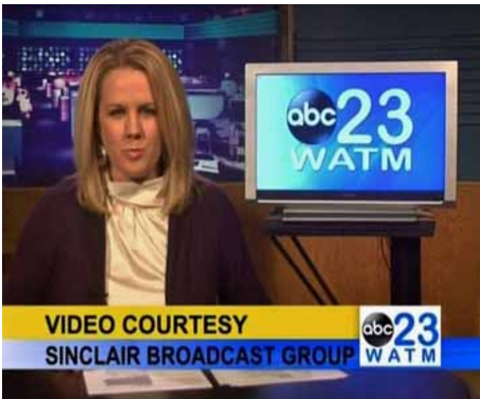
WATM-24.1 Altoona, PA 252 mi Tr seen 9-24-13