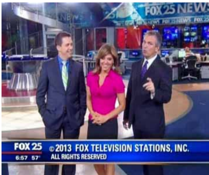
WFXT-31.1 Boston, MA 152 mi Tr seen 10-11-13