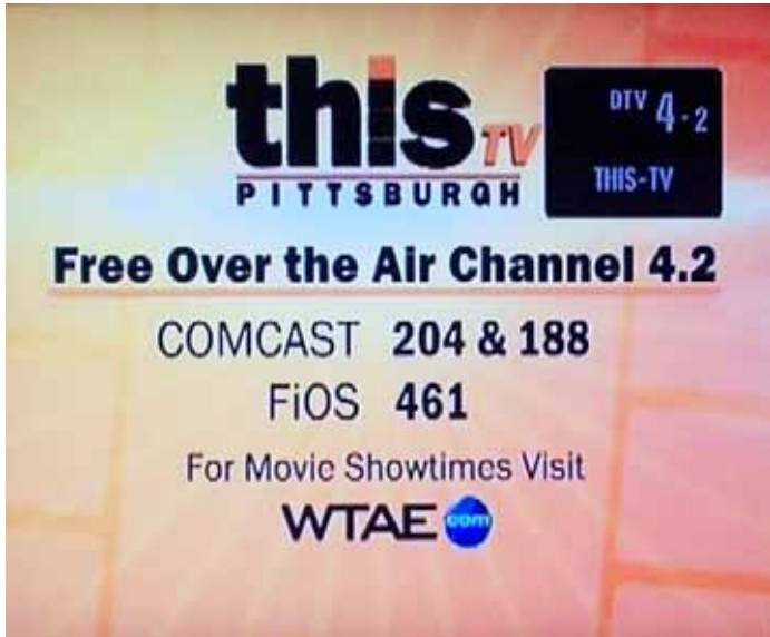
WTAE-51.2 Pittsburgh, PA 328 mi Tr seen 8-10-13