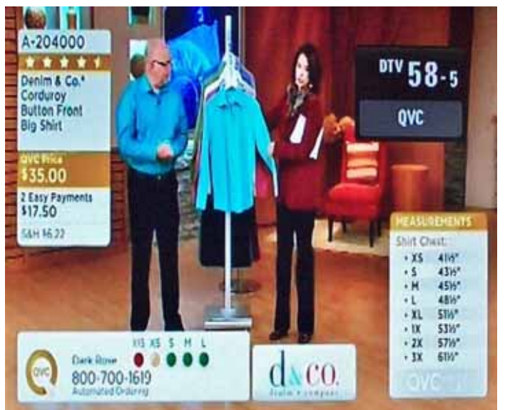
WDPX-40.5 Vineyard Haven, MA 171 mi Tr seen 9-21-13