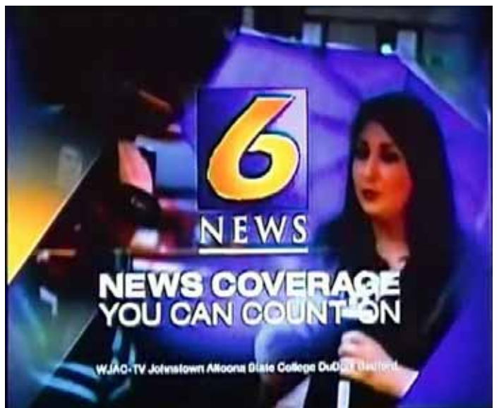
WJAC-22.1 Altoona, PA 252 mi Tr seen 9-24-13 "7.5 kW xltr"