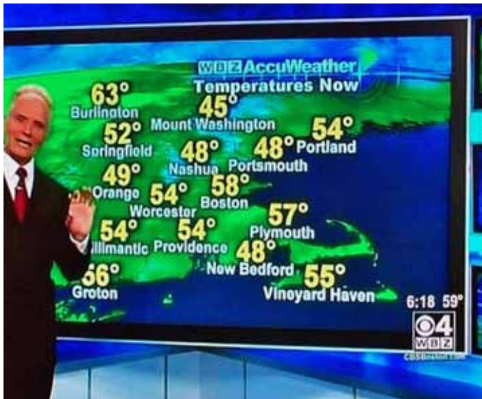
WBZ-30 Boston, MA 152 mi Tr seen 9-21-13