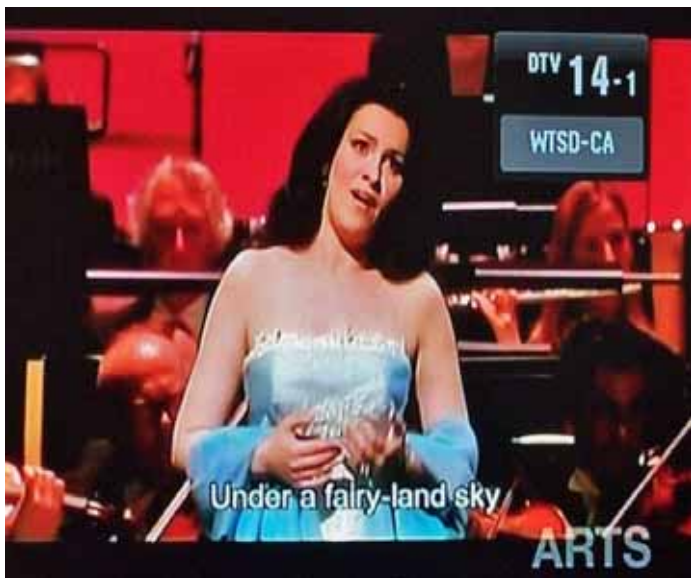
WTSD-CD 23.1 Philadelphia, PA 139 mi Tr seen 9-21-13