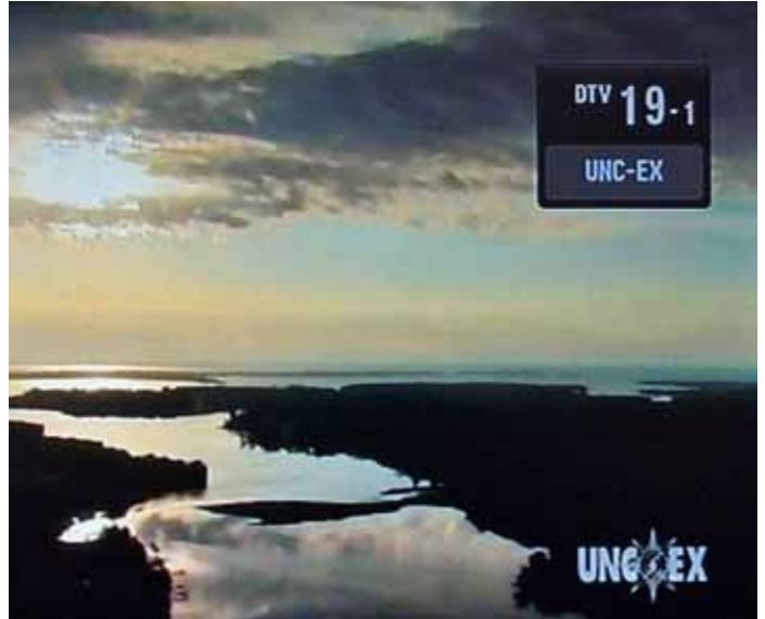
WUNM-19.1 Jacksonville, NC 517 mi Tr seen 5-5-13