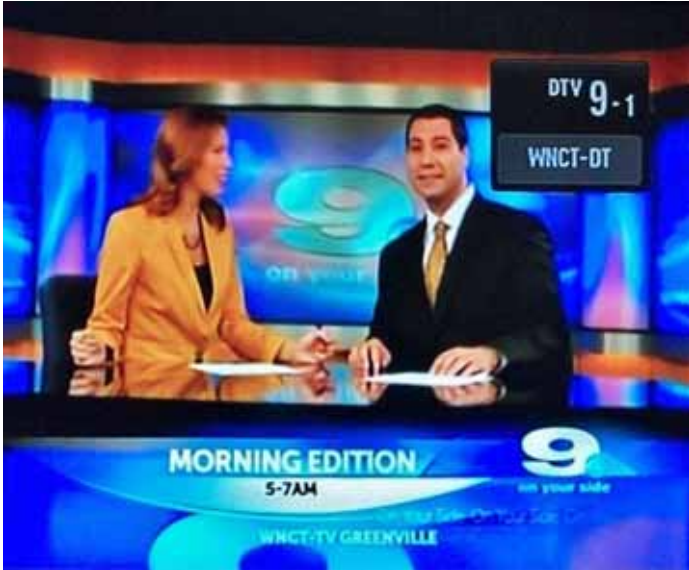
WNCT-10.1 Greenville, NC 460 mi Tr seen 5-5-13