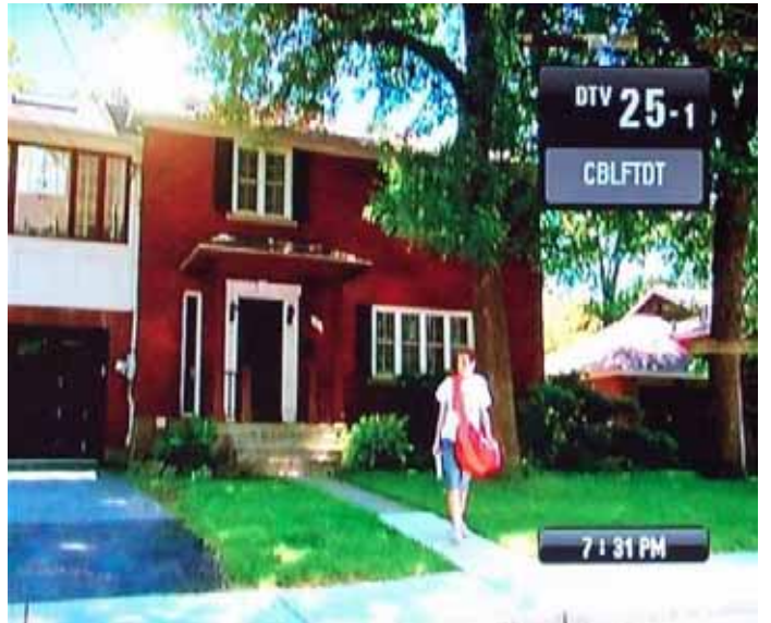
CBLFT-25 Toronto, ON 308 mi Tr seen 9-9-13 "1st Canadian DTV tropo"