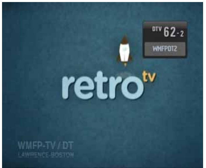
WMFP-18.2 Lawrence, MA 156 mi Tr seen 10-11-13