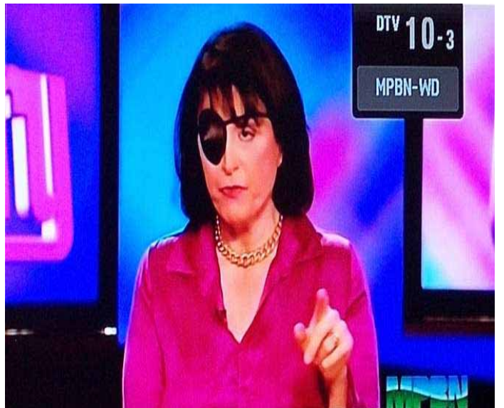
WCBB-10.3 Augusta, ME 256 mi Tr seen 9-21-13 "No sound"