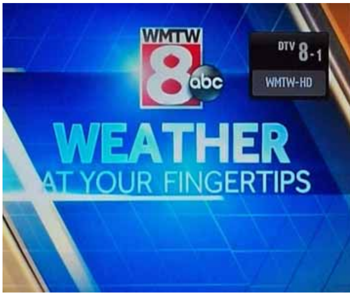
WMTW-8.1 Poland Spring, ME 239 mi Tr seen 9-21-13