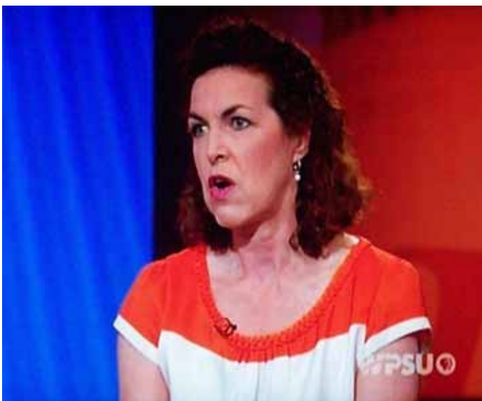
WPSU-15.1 Clearfield, PA 237 mi Tr seen 8-10-13