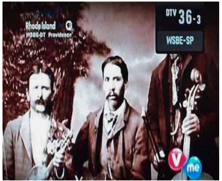
WSBE-21.3 Providence, RI 128 mi Tr seen 9-21-13