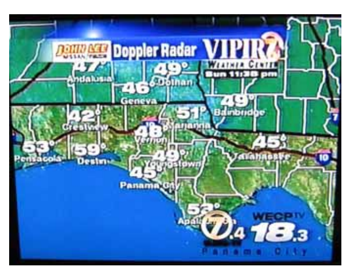
WEAR-17 Pensacola, FL 448 mi Tr seen 2-17-14

WJHG-7 Panama City, FL 343 mi Tr seen 2-17-14