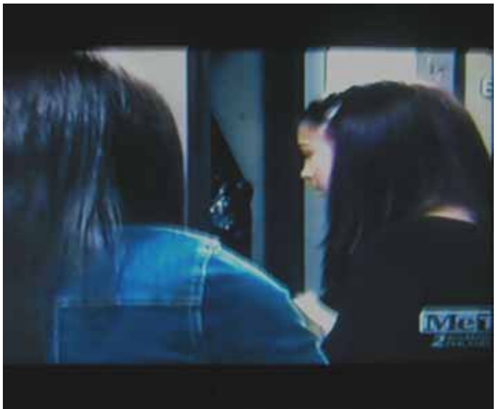
KJWP-2 Wilmington, DE 987 mi Es seen 5-4-14 first DXer to log this by E-skip!