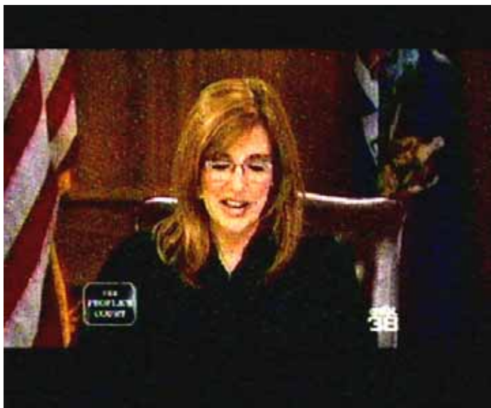
WTTA-32 St. Petersburg, FL 197 mi Tr seen 3-13-14