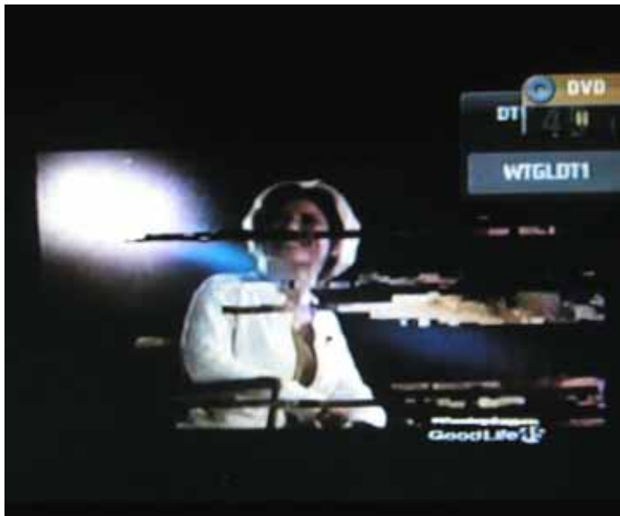
WTGL-46 Leesburg, FL 221 mi Tr seen 5-8-14 "Over full power local WHFT!"