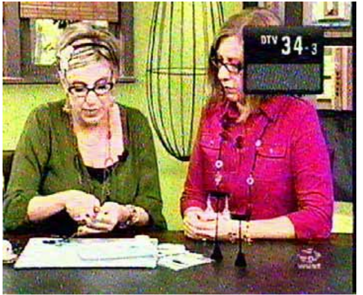
WUSF-34.3 Tampa, FL 197 mi Tr seen 3-8-14