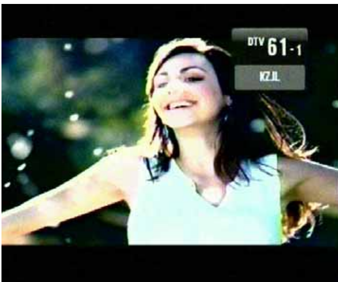
KZJL-44 Houston, TX 966 mi Tr seen 3-30-14