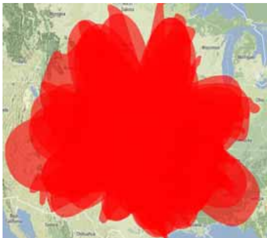
APRS map indicates 144 MHz. Es across the plains – May 25