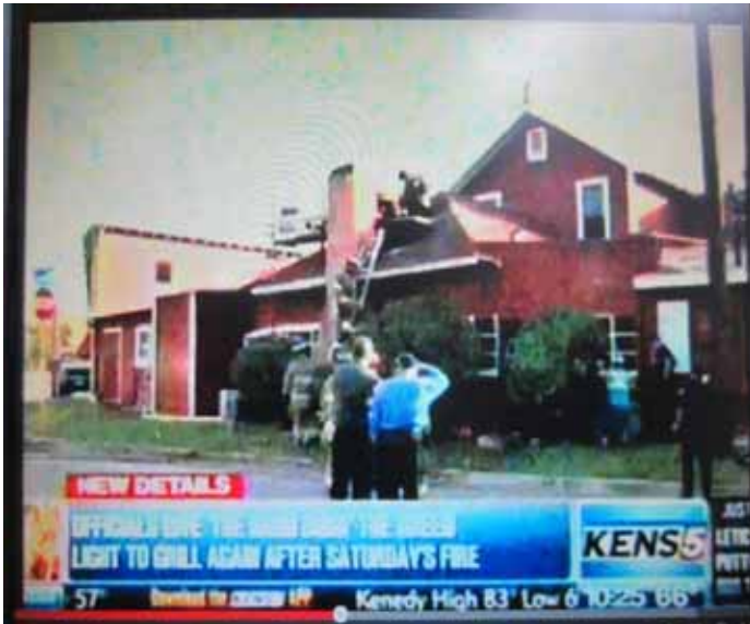
KENS-39.1 San Antonio, TX 1090 mi Tr seen 3-30-14