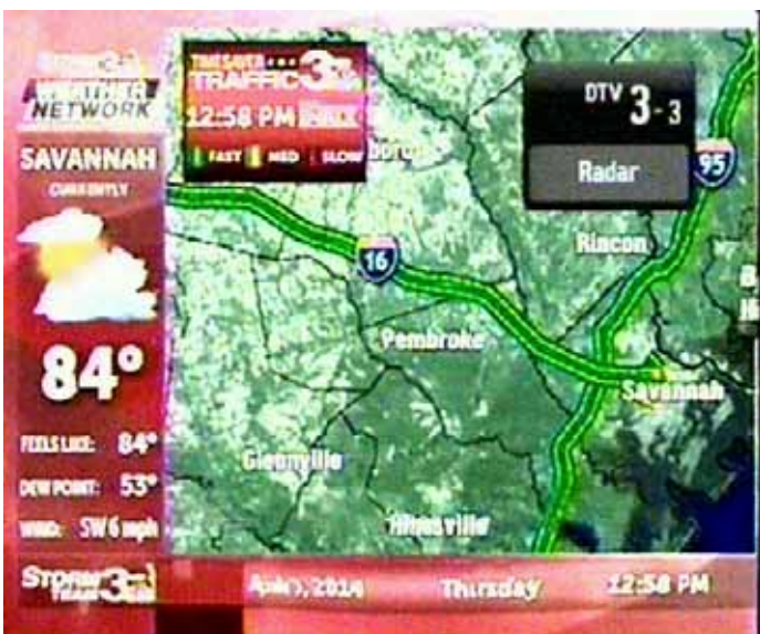
WSAV-39.3 Savannah, GA 422 mi Tr seen 4-3-14