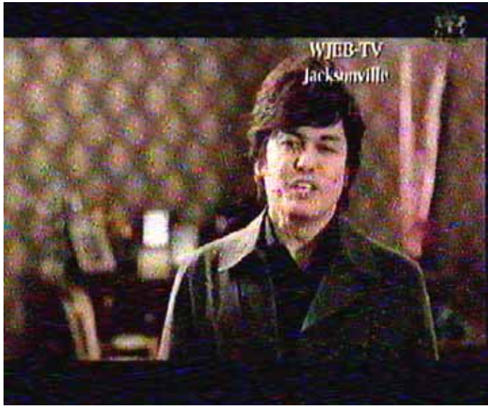
WJEB-44 Jacksonville, FL 303 mi Tr seen 4-7-14