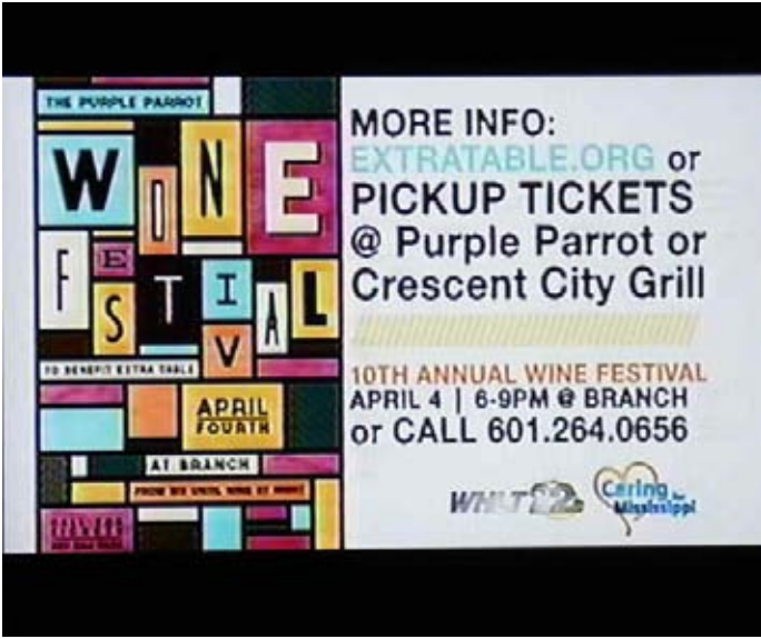
WHLT-22 Hattiesburg, MS 556 mi Tr seen 4-1-14