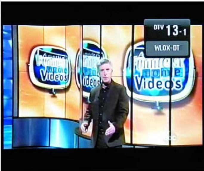
WLOX-39 Biloxi, MS 504 mi Tr seen 4-1-14