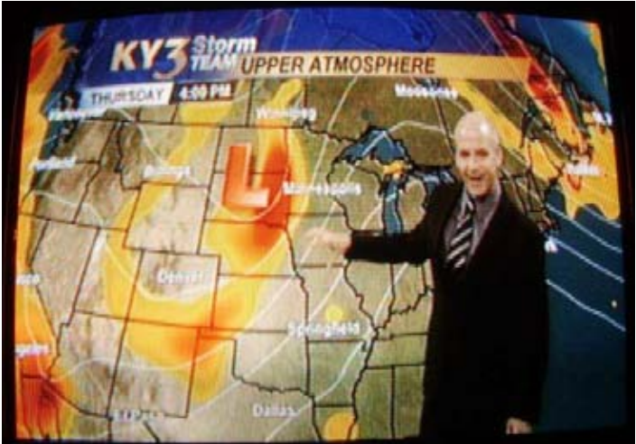
KYTV-44.1 Springfield, MO 260 mi Tr seen 5-6-14