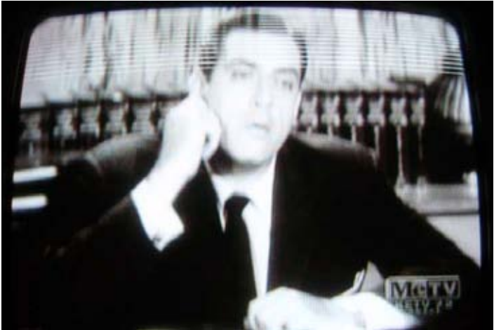
KETV-20.2 Omaha, NE 351 mi Tr seen 5-7-14