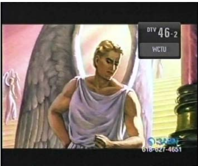
WCTU-LD 46 Pensacola, FL 424 mi Tr seen 5-24-14 "New LD record!"