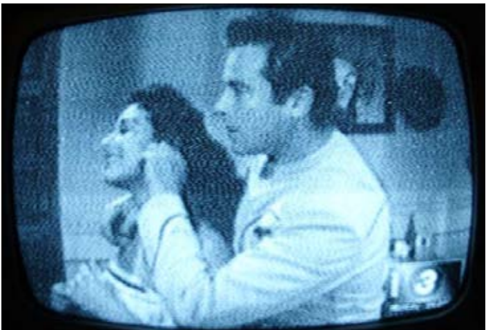
XHBC-3 Mexicali, BCN 1033 mi Es seen 5-19-14