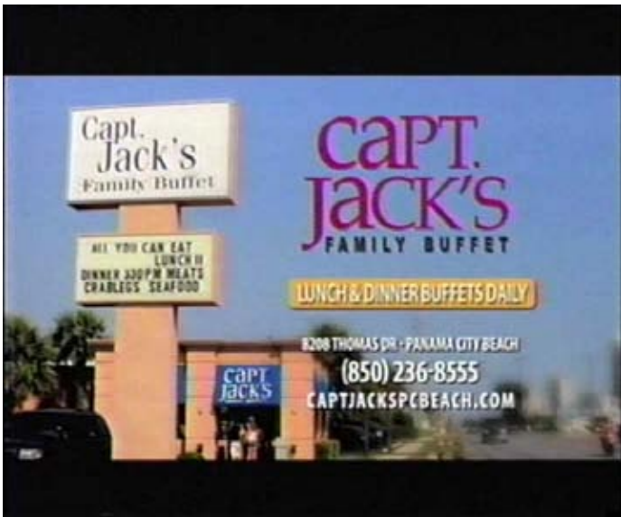
WPCT-47 Panama City Beach, FL 345 mi Tr seen 5-24-14