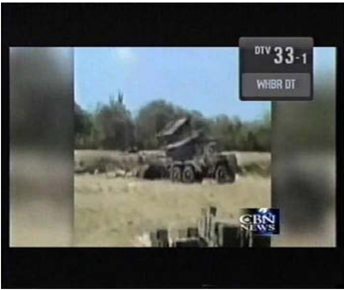
WHBR-34 Pensacola, FL 424 mi Tr seen 5-24-14