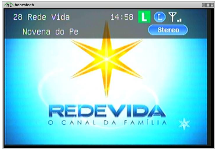
Rede Vida-32 Sorocaba, Brazil (local)