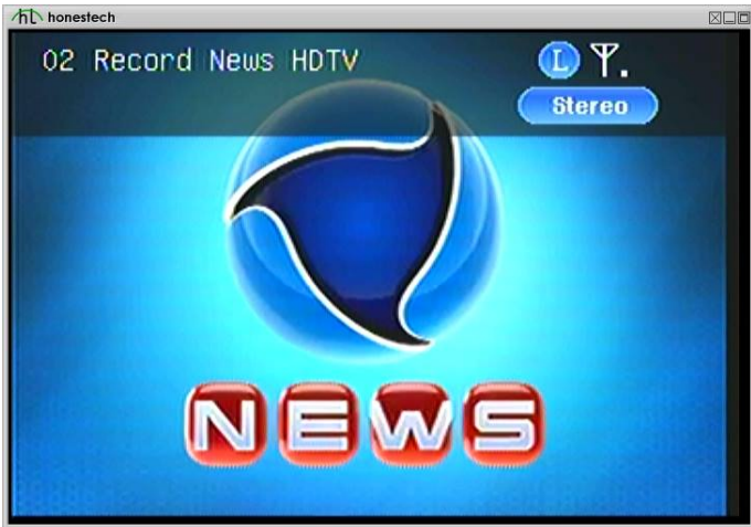
Record News-46 Campinas, Brazil 78 km Odd that they use English "news"