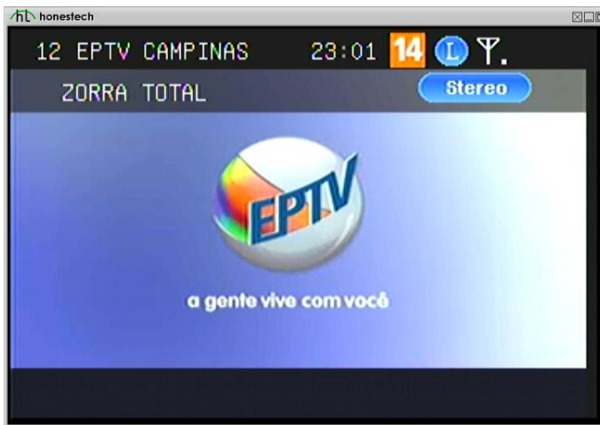
EPTV-42 Campinas, Brazil 78 km (semi local)