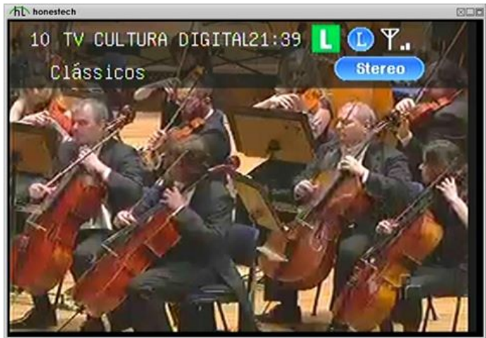
TV Cultura-38 Campinas, Brazil 78 km