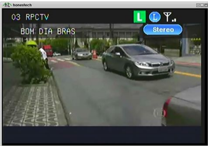
RPC TV-42 Londrina, Brazil 380 km Tropo