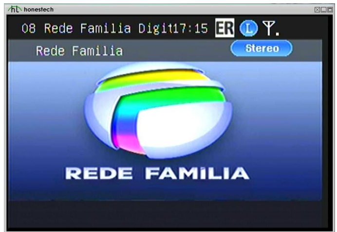
Rede Família-44 Campinas, Brazil 78 km