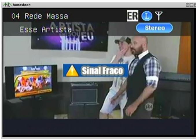
TV Iguaçu-39 Curitiba, Brazil 282 km Tr