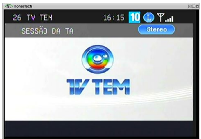
TV TEM-26 Sorocaba, Brazil (local)