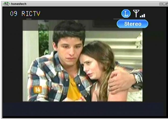
RIC TV-49 Londrina, Brazil 380 km Tropo