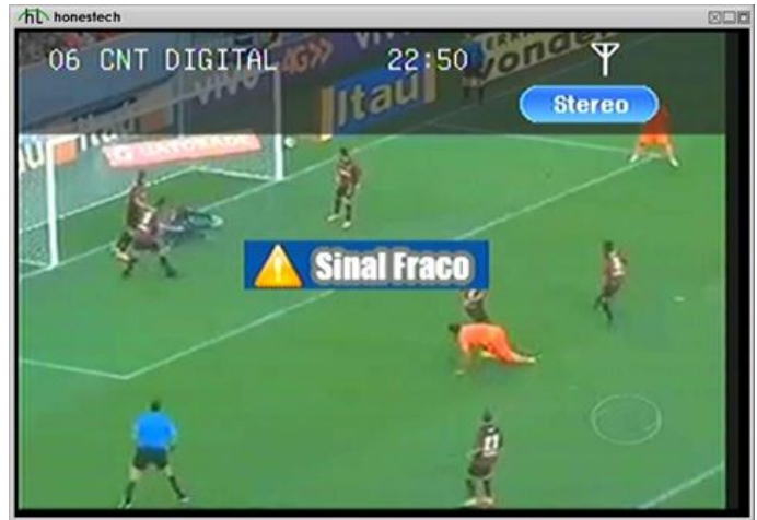
CNT-43 Curitiba, Brazil 281 km Tropo reads, "weak signal"