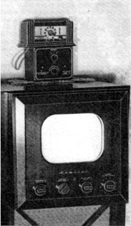
Multiple boosting is necessary for reception.

Are owners satisfied with their sets and with the reception they have been getting? The answer, surprisingly, is a very definite "yes." A few owners did not know what to expect, and they have been very much disappointed. They are the ones who were expecting to get pictures like home movies, something that just can't be done yet, at least not in marginal areas. Not all locations will give satisfactory reception, and an owner who installs a TV set in a particularly bad location may never be able to pick up a recognizable test pattern. Would-be viewers must be warned of possible complete failure, or unsuccessful installations will create bad will toward the installer.