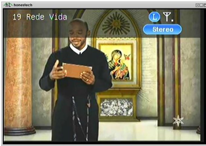
Rede Vida-18 Maringá, Brazil 457 km Tropo "personal best distance record"