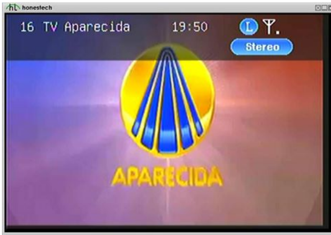
TV Aparecida-17 Sorocaba, Brazil (local)