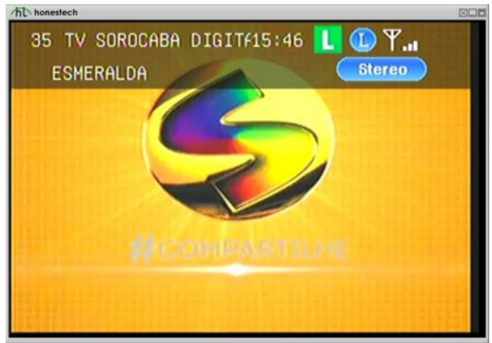
TV Sorocaba-35 Sorocaba, Brazil (local)