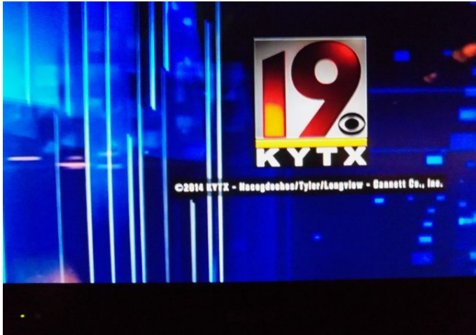
KYTX-18 Nacogdoches, TX 507 mi Tropo seen 2-18-15

Sorry, no column last month due to work constraints, and also because there haven't been many photos posted on the Forums or sent to me. We pick up with a few photos from this dismal winter season from the prolific Ed Phelps NN2E of Otis, KY: