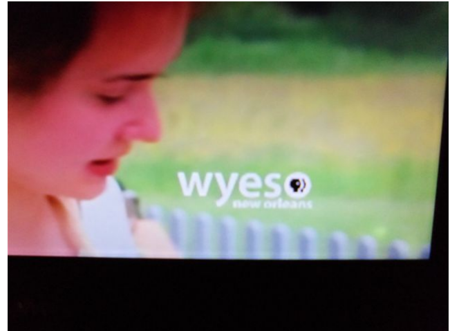
WYES-11 New Orleans, LA 482 mi Tr seen 2-10-15