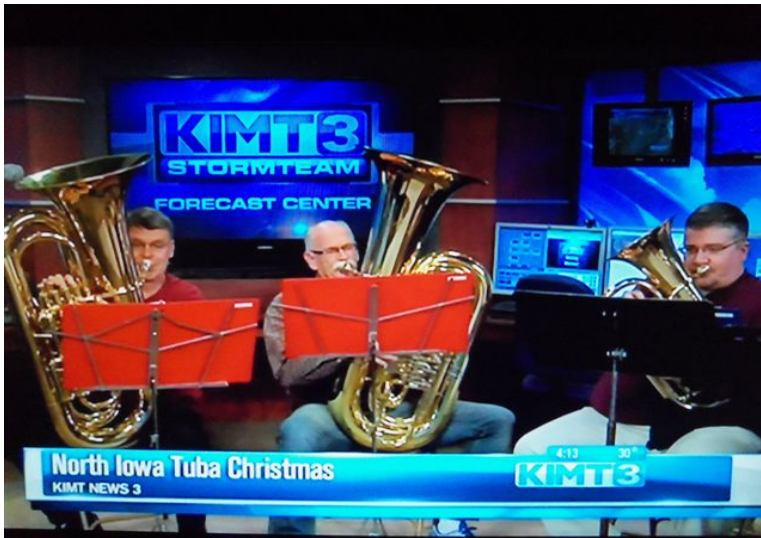
KIMT-42 Mason City, IA 510 mi Tr seen 12-10-14 Boy, they really know how to party in N. Iowa!