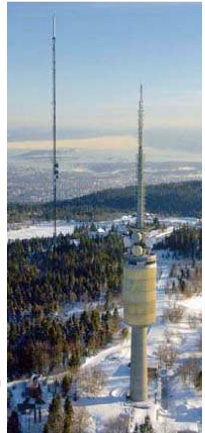
Tryvannstårnet broadcast tower (right) stands 387 feet tall, on the 1,736 ft summit of Tryvannshøyden hill near Oslo.

It will probably be many years or decades before analog terrestrial broadcasts will be ended in North America. Currently, America looks like it is heading towards Wi-Fi as a digital multimedia distribution system. Time will tell!