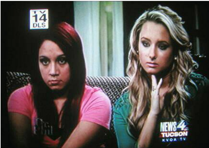
K04QP-D Casas Adobes, AZ 1002 mi Es seen 6-23-15