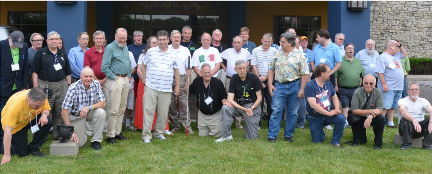
Convention attendees in Fort Wayne.