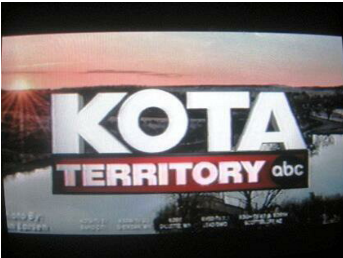
KOTA-2 Rapid City, SD 949 mi Es seen 6-28-15