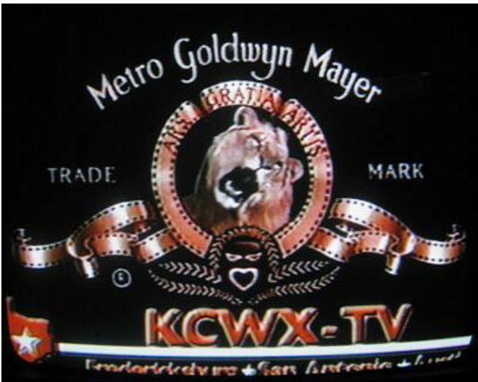
KCWX-5 Fredericksburg, TX 338 mi Tr seen 3-25-15