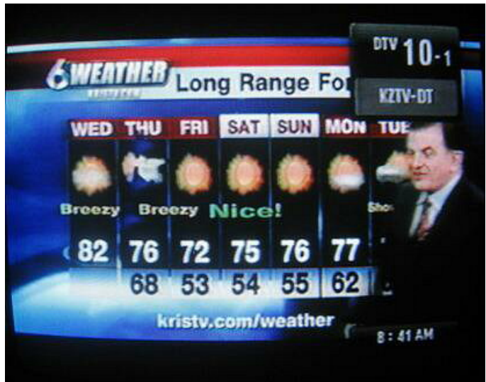
KZTV-10 Corpus Christi, TX 400 mi Tr seen 3-25-15 "w/KRIS-6 weather"