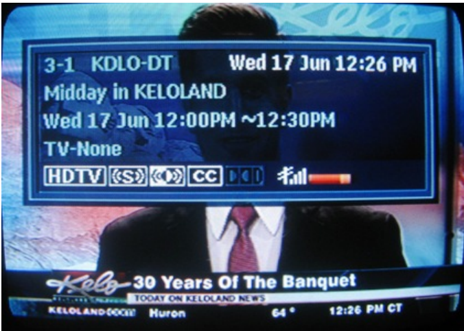
KDLO-3 Florence, SD 889 mi Es seen 6-17-15