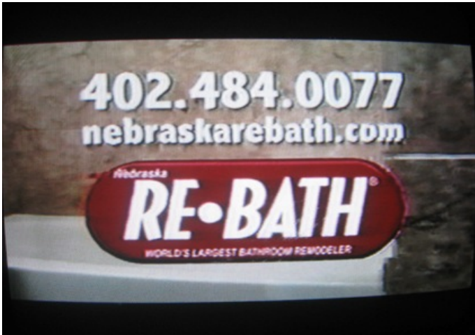
KSNB-4 Superior, NE 579 mi Es seen 6-28-15 "1 of 10 decodes that day"