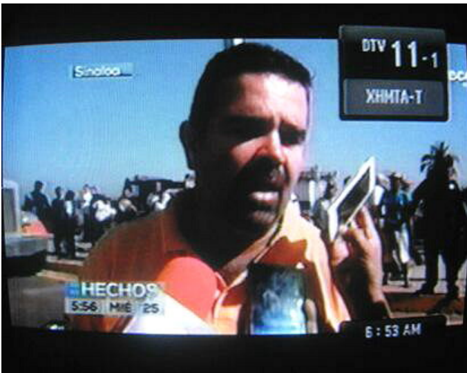
XHMTA-12 Matamoros, TAM 505 mi Tr seen 3-25-15 "New"