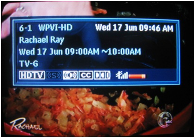
WPVI-6 Philadelphia, PA 1152 mi Es seen 6-17-15