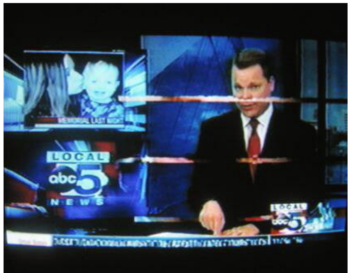
WOI-5 Ames, IA 659 mi Es seen 6-17-15