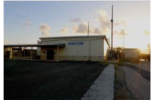
The Radio GTMO building sits on a secluded peninsula surrounded by large radio dishes on U.S. Naval Station Guantanamo Bay, Cuba. American Forces Network Guantanamo Bay has called the same building home since 1964.