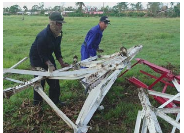
Salvaging the Losses - One of several Radiocuba tower crews working on one of the 18 broadcast towers lost in the Hurricane Irma destruction.