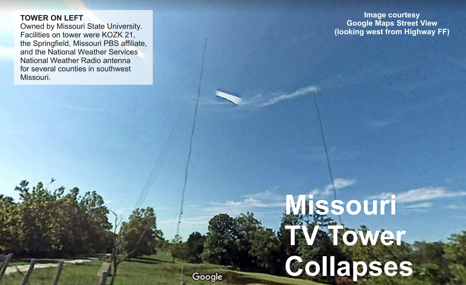
(looking west from Highway FF)

Owned by Missouri State University. Facilities on tower were KOZK 21, the Springfield, Missouri PBS affiliate, and the National Weather Services National Weather Radio antenna for several counties in southwest Missouri.