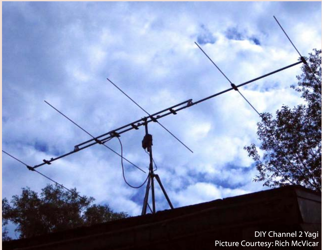
DIY Channel 2 Yagi