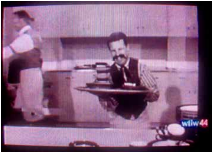
WTLW-4 Lima, OH 1041 mi Es Seen 7/20/19