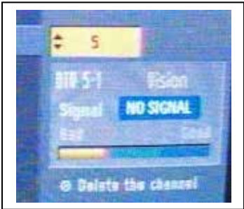
KTDJ-LD-5 Dayton, TX 39 mi GW (3 kW) Seen 6/11/19 "Vision Celestial"