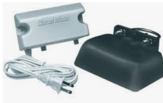
Channel Master 7777 Titan2 VHF/UHF ...

In New York, WPXU-LD and W31EF both filed for displacement to channel 29. Of course, both requests could not be granted. The stations reached an agreement wherein WPXU has withdrawn its application for full possession of channel 29; asked the FCC to grant their rival's request for the same channel; and then share on the W31EF transmitter.