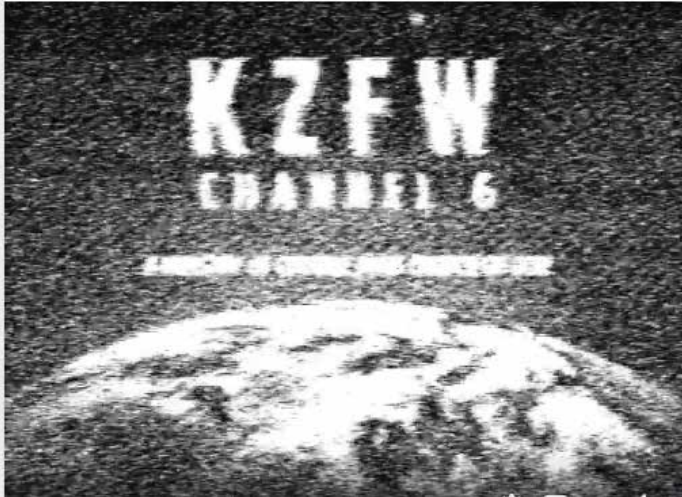
KZFW-LP-6 Dallas, TX 1194 mi Es Seen 7/20/19 "franken FM"