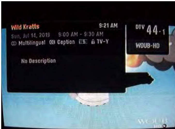
WOUC-6 Cambridge, OH 872 mi Es Seen 7/14/19 "Wrong calls"