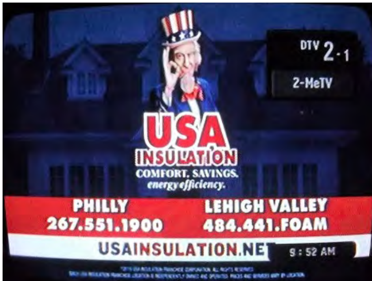
WDPN-2 Wilmington, DE 1155 mi Es Seen 7/14/19