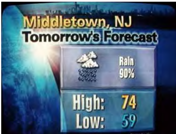
WJLP-3 Middletown Twp., NJ 1234 mi Es Seen 6/12/19