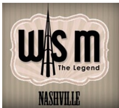
The WSM-FM 1945 logo.