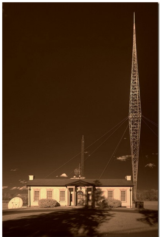
The WSM transmitter building

The National Life and Accident Insurance Company (NL&AI), owners of WSM, realized that few area households had FM receivers and that its commercial potential was lacking, unlike the company's television station, WSM-TV (now WSMV). They shut down the FM operations in 1951 and returned the license to the FCC. The station went back on the air in the late 1950s after an upsurge in high fidelity equipment.