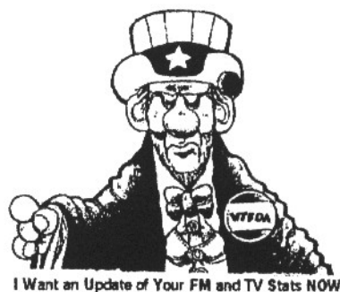
I Want an Update of Your FM and TV Stats NOW

WTFDA members are requested to email their TV/FM statistics updates to me by the end of March 2022.