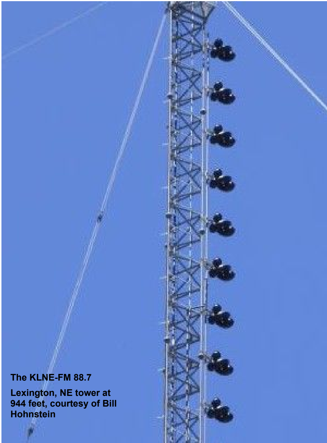
The KLNE-FM 88.7 Lexington, NE tower at 944 feet