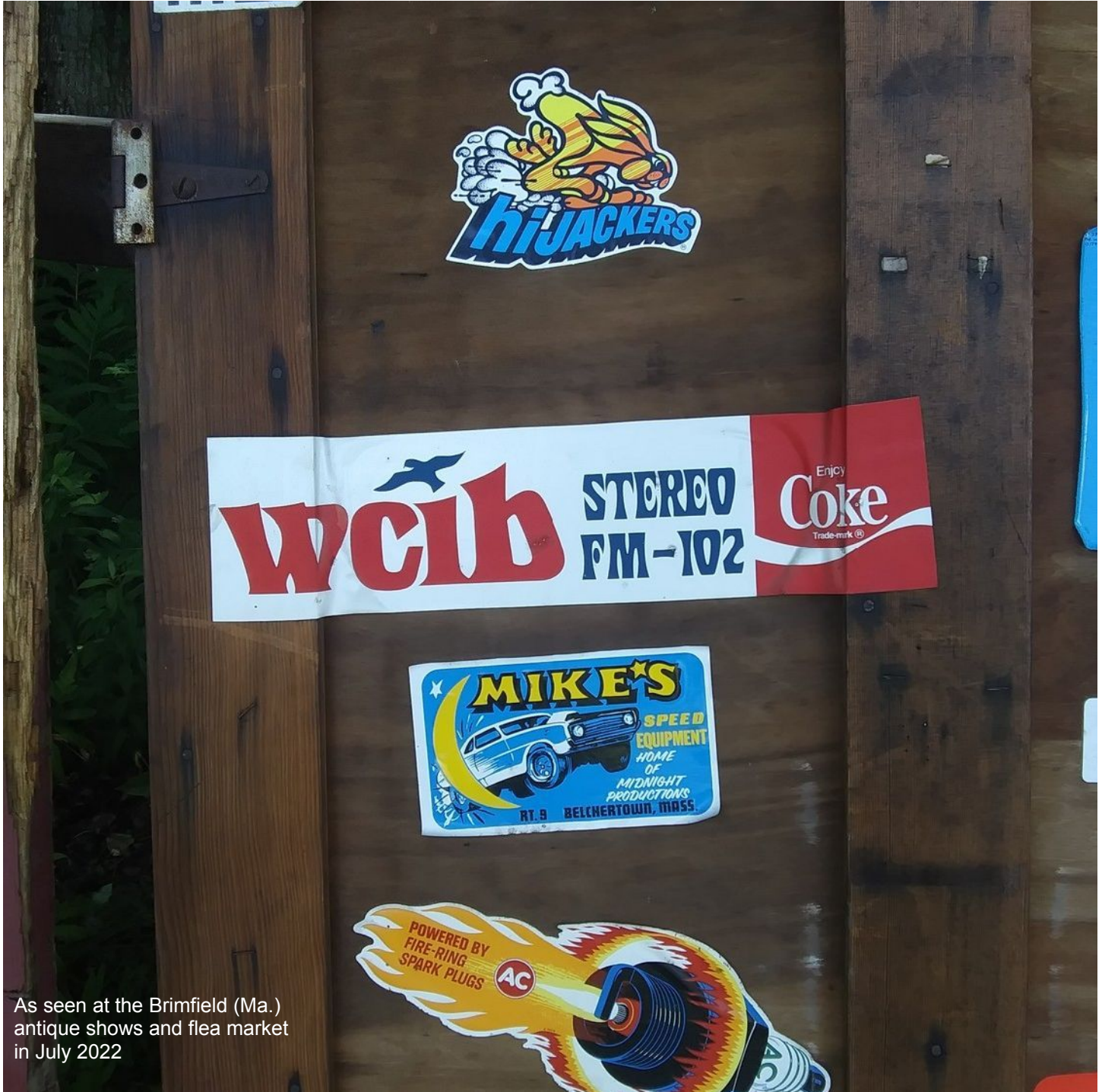
As seen at the Brimfield (Ma.) antique shows and flea market in July 2022