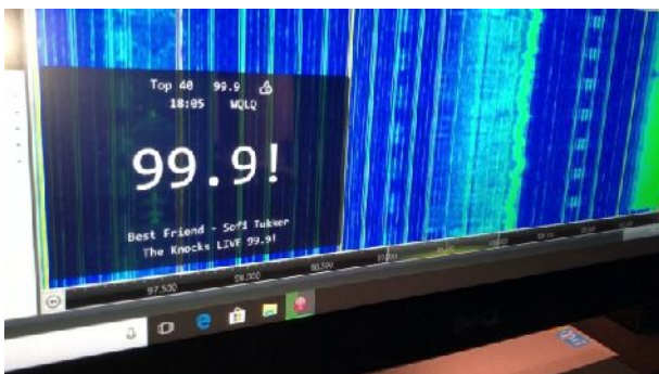
SDR Console v3