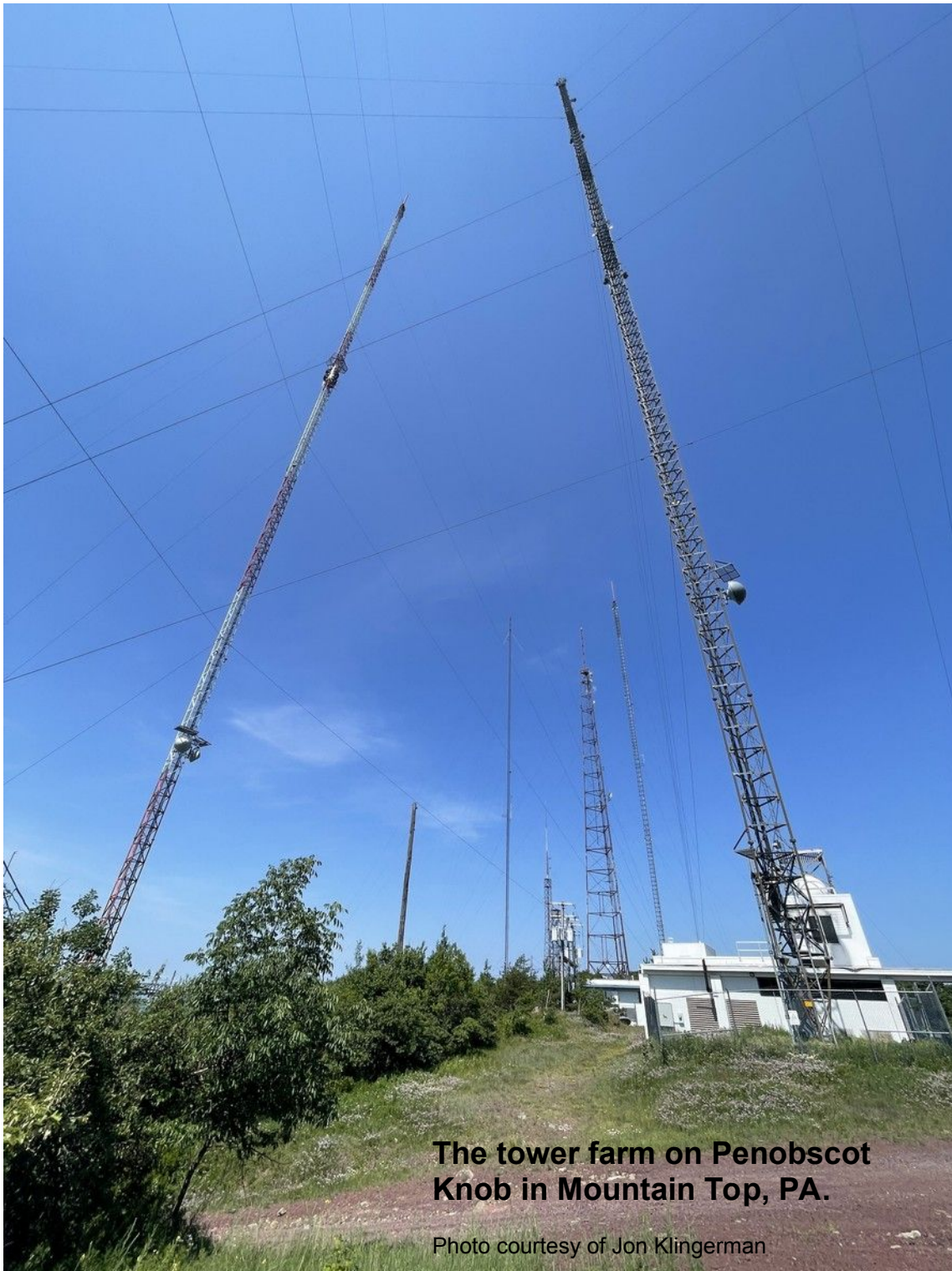
The tower farm on Penobscot Knob in Mountain Top, PA.