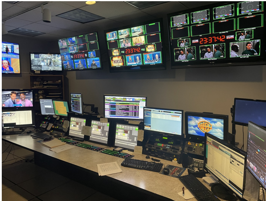
The WOLF-WSWB-WQMY TV Control Room