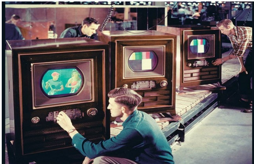
Men Tuning TVs at the TV factory.