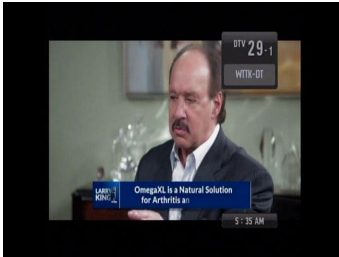
WTTK 15 (29) Kokomo, IN 255 miles (410 km) tropo Seen June 7, 2020

That will wrap up another column...please report! 73 and good DX from the Florissant Valley Dial Twister.