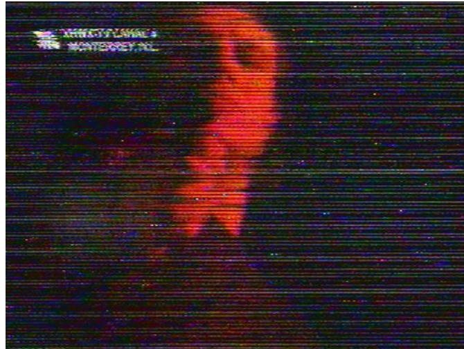
XHWX 4 Monterrey, NL 1,075 miles (1,730 km) E-skip Seen July 9, 2014

Now, here's a couple of TV DX captures from my archives: