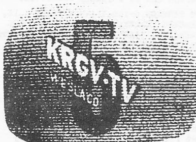
KRGV-5, Weslaco, Tx. 520 mile tropo (RL)