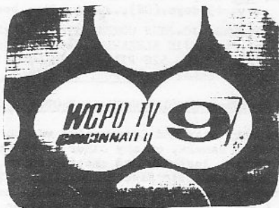
WCPO-9, Cincinnati, Oh. 640 mile tropo 9/19/70 (LP)