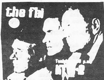
KTVI-2, St. Louis, Mo. 1,110 mile Ts 8/29/72 (RL)

First, some photos of TV-DX forwarded by Hq :