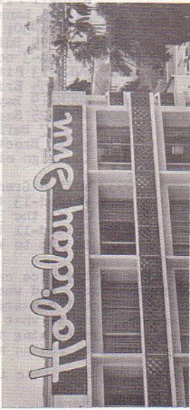
1975 WTFDA Convention site: West Palm Beach, Florida Holiday Inn