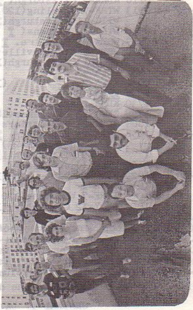
Group photo of attendees taken Saturday afternoon