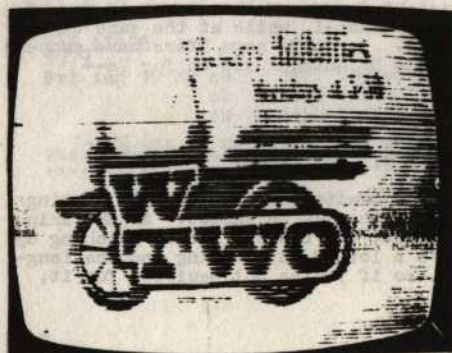
30 WTWO- 2 Terre Haute, IN E-skip (Barber)