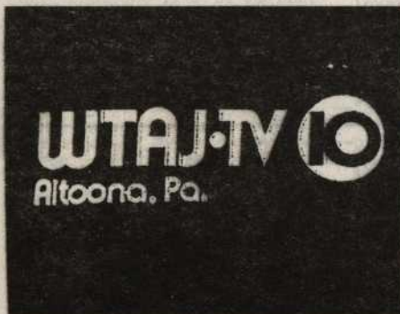
WTAJ-10 Altoona, PA 275 mile tropo (Gaines)