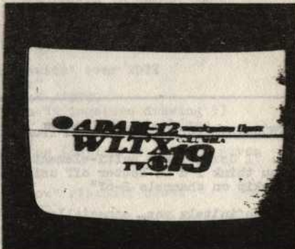
WLTX-19 Columbia, SC 390 mile tropo (Combs)