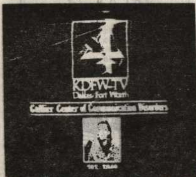
KDFW- 4 Dallas, TX 965 mile E-skip (Combs)