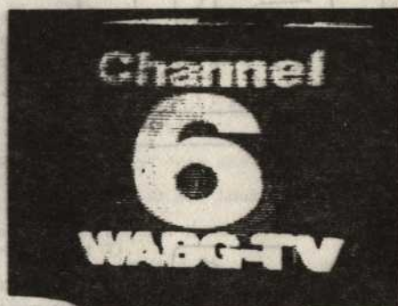
WABG- 6 Greenwood, MS E-skip (Grant)