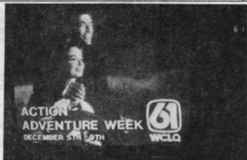
WCLQ-61 Cleveland, OH 400 mile tropo seen on Dec. 3, 1983 (NE)