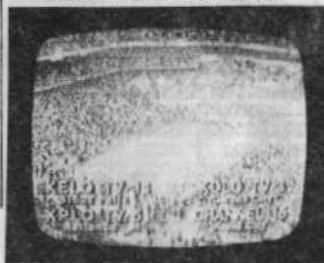
KDLO-3 Garden City, SD 940 mile ES seen 1-7-84 (DN)