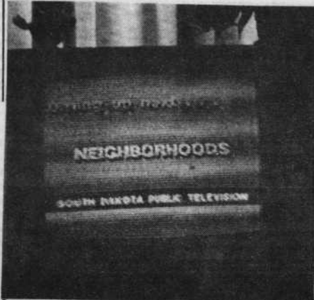
KUSD-2 Vermillion, SD 878 mile E-skip seen Jul 2, 1985 at 1230 EDT [rece 1-16-86] (4-ms)