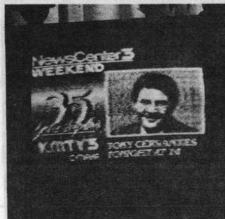
KMTV-3 Omaha, NE 797 mile E-skip seen Jun 22, 1985 at 2000 EDT

Your support is what keeps this and other VLD columns going. Thanks for the photos; send some more in real soon.