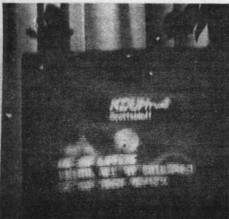
KDUH-4 Scottsbluff, NE 1206 mile E-skip seen Jul 2, 1985 at 1230 EDT [rece 1-16-86] (5-ms)