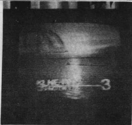
KLNE-3 Lexington, NE 958 mile E-skip seen Jul 2, 1985 at 1400 EDT [rece 1-16-86] (6-ms)