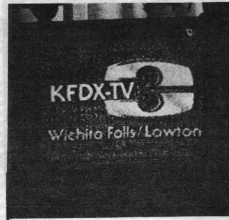
KFDX-3 Wichita Falls, TX-Lawton, OK 936 mile E-skip seen Jun 23, 1985 at 1430 EDT